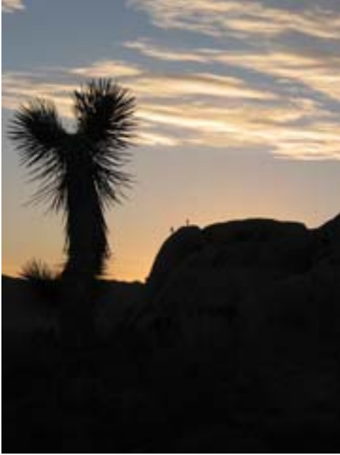
Sunset with Silhouette of Joshua Tree and Climbers on Dome - Joshua Tree ↑