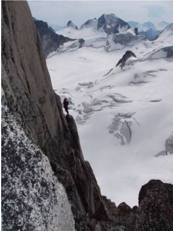
Adan on Surf's Up ledge

climber/traveler, the season is very short, 1-2 months tops, and because weather can be so unpredictable, 2 weeks is minimum if you don't want to risk that the one week you choose to come is the week of bad weather.