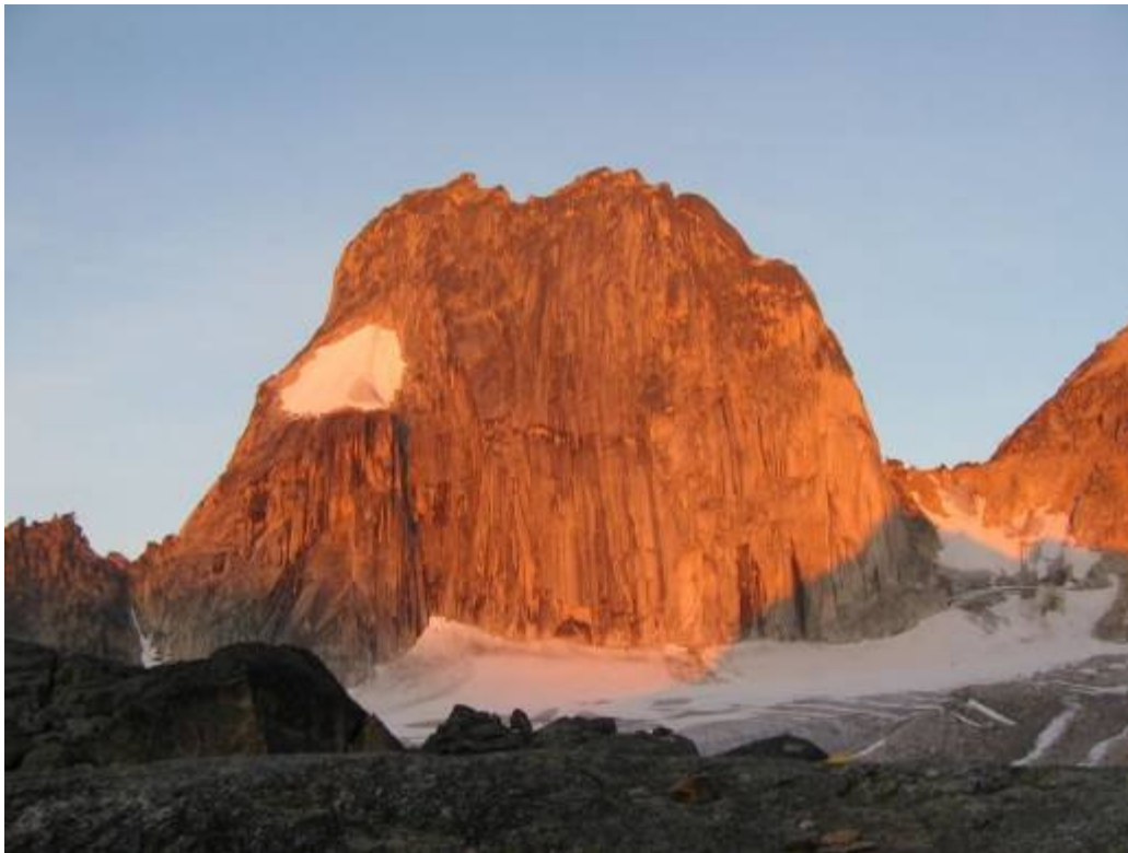
Snowpatch Spire in the morning

I had been in Squamish, BC two weeks before, drove down to Santa Cruz, stayed there for a little more than a week, and then I was going back up north to Bugaboos, on the East side of BC near the Alberta border. How crazy is that? There are two questions you can ask, depending on which answer I want to give: why did I drive down to Santa