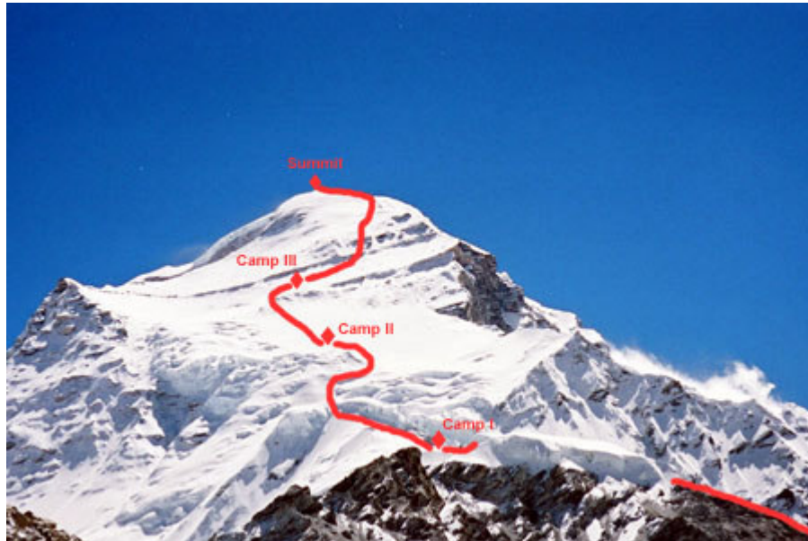
Cho Oyu – the Turquoise Goddess