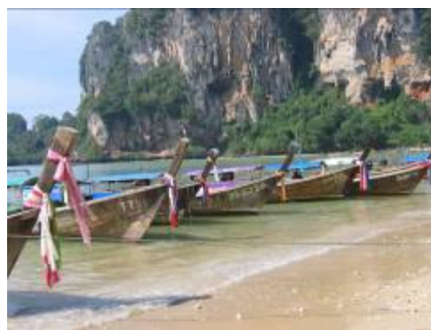
Long-tail boats are the mode of transport in Railay