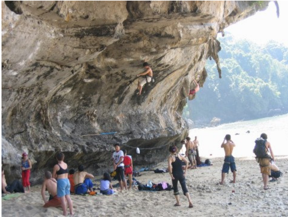
Ton Sai Wall